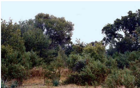
Fig.1 The original maquis vegetation in study area

To illustrate this new concept of “erosion” and to show that this is a new environmental challenge for soil scientists because soil genetic erosion may be even more dangerous than the “traditional” one. I wish to refer to a study case in Southeast Sicily (Italy), in an area with a Mediterranean climate and with several kind of soils (Inceptisols, Vertisols, Mollisols, Alfisols and Entisols). These soils performed a strong capacity in producing ecosystem services, helped also by a maquis vegetation (Fig.1) and a considerable presence of biota.