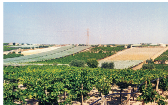
Fig.2 Land use change with the transformation of the soilscape originated wide areas with only one soil type (anthropogenic soil)

So, due to soilscape transformation, not only animals and plants disappear form the Earth’s surface, but also the soils disappear (Fig. 2).